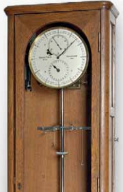
Riefler Price Realised EUR 43.400