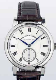
Lange & Söhne Price Realised EUR 130.200