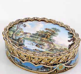
Louis Galopin Price Realised EUR 46.000