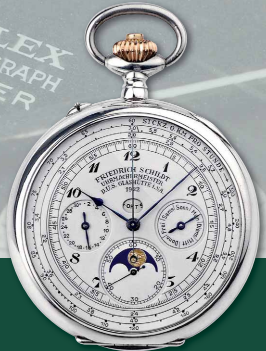
Deutsche Uhrmacherschule Glashütte i/SA

Saturday, 15 November 2014 Hotel Sheraton · Frankfurt Airport