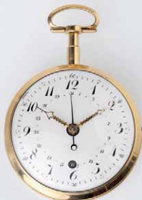
Seyffert Price Realised EUR 111.600