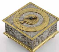
Ulrich Schniepp Price Realised EUR 39.700