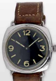
Panerai Price Realised EUR 90.250