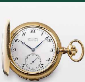
Ulysse Nardin Price Realised EUR 86.400