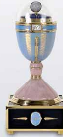
Fabergé Price Realised EUR 248.000