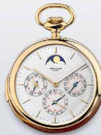
Patek Philippe Price Realised EUR 89.300