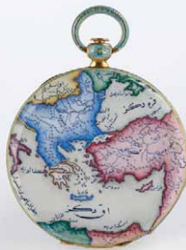
Chenevard Price Realised EUR 96.800