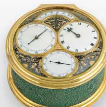
Barraud Price Realised EUR 273.000